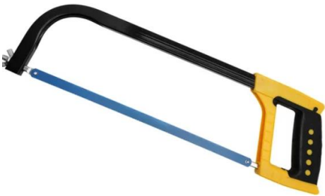
HACKSAW WITH BLADE