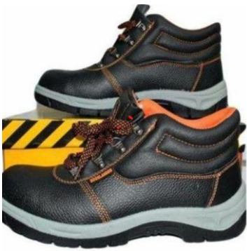
9. SAFETY BOOTS – ALL TRADES