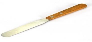
14. Two knives (one small and one big)