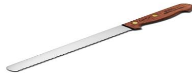
15. One pastry cutter