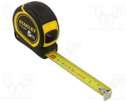
Tape measure – 5m and above - COMPULSORY