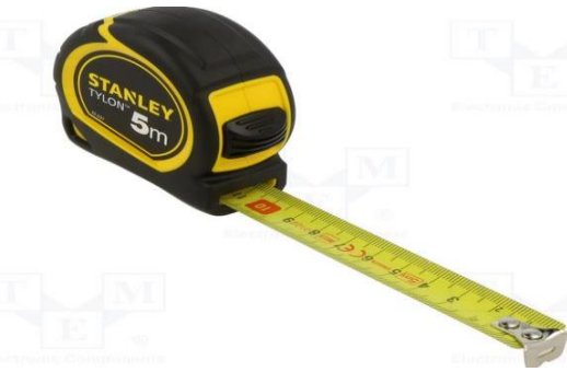
Tape measure – 5m and above - COMPULSORY