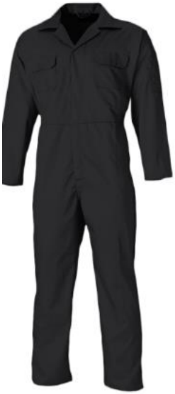
8. Overall for Masonry level 3,4 and Building level 5&6 – Black