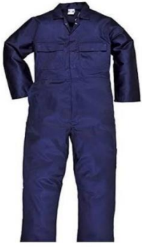
Level 6 – Navy blue

Overall for civil engineering level 6/ water technology engineering level 6